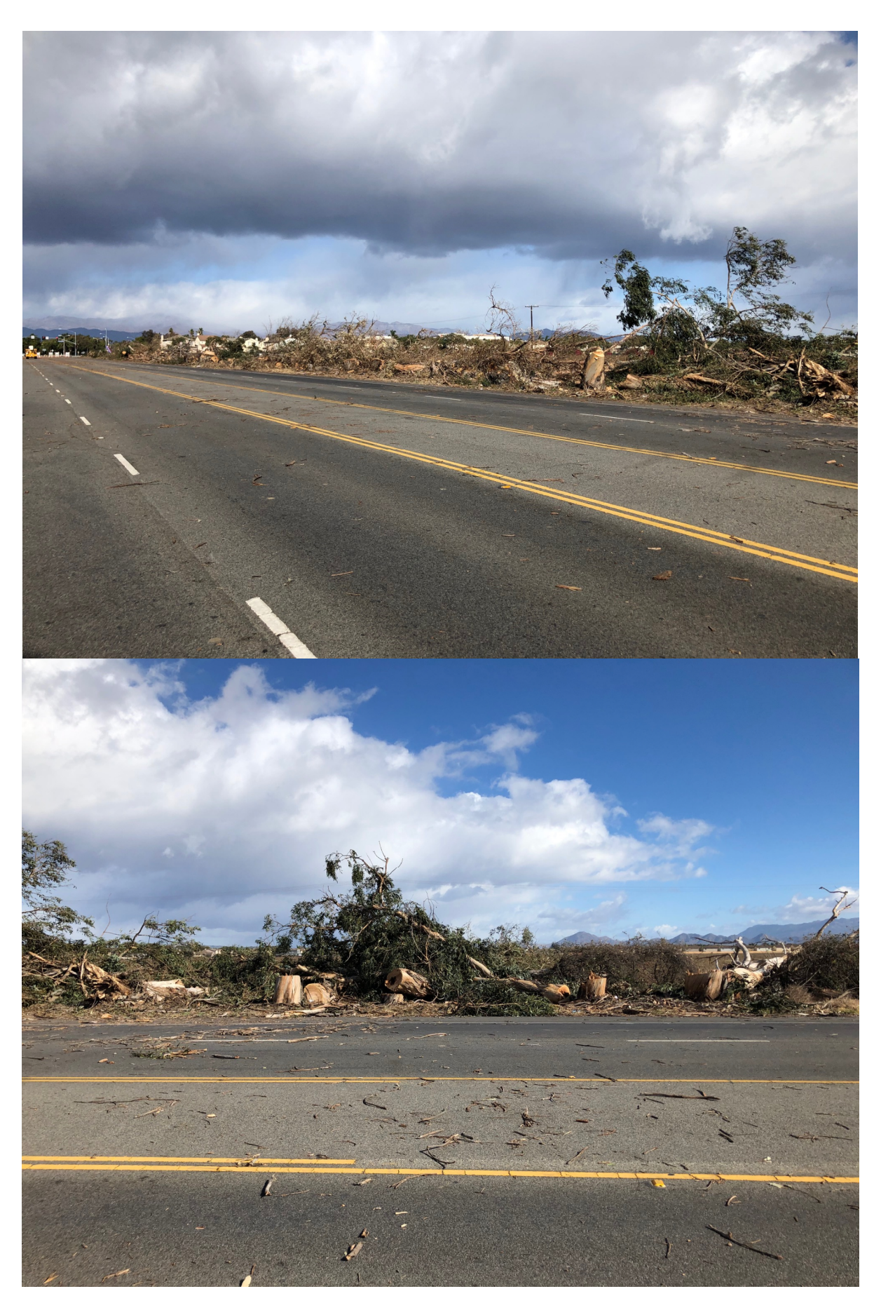
OUHSD\ Addendum\ \#I\ Bid\ 645\ Rose\ Avenue\ Tree\ Removal\ for\ Del\ Sol\ High\ School