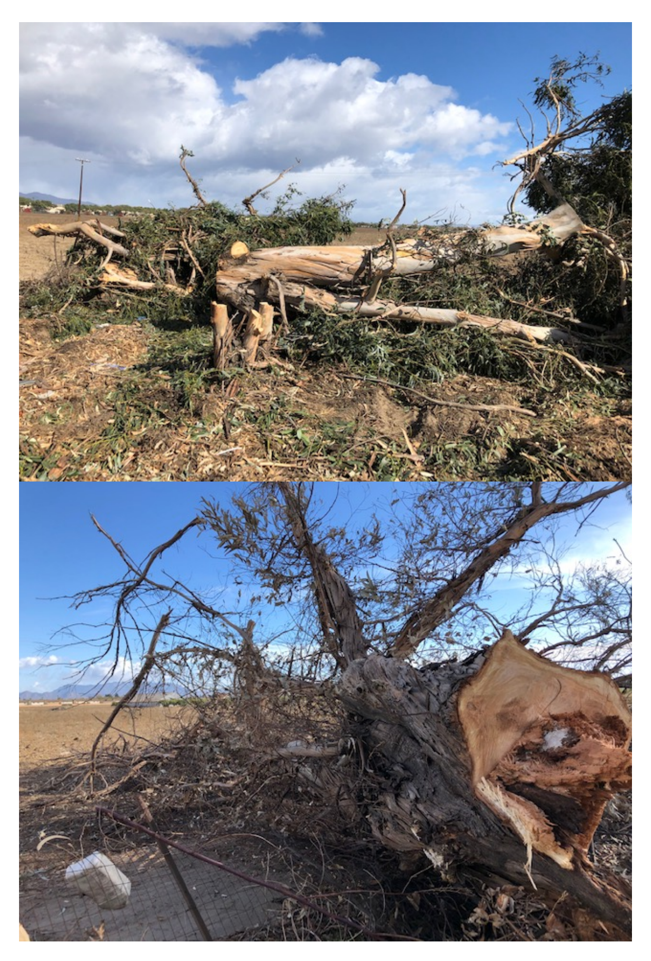
OUHSD\ Addendum\ \#I\ Bid\ 645\ Rose\ Avenue\ Tree\ Removal\ for\ Del\ Sol\ High\ School