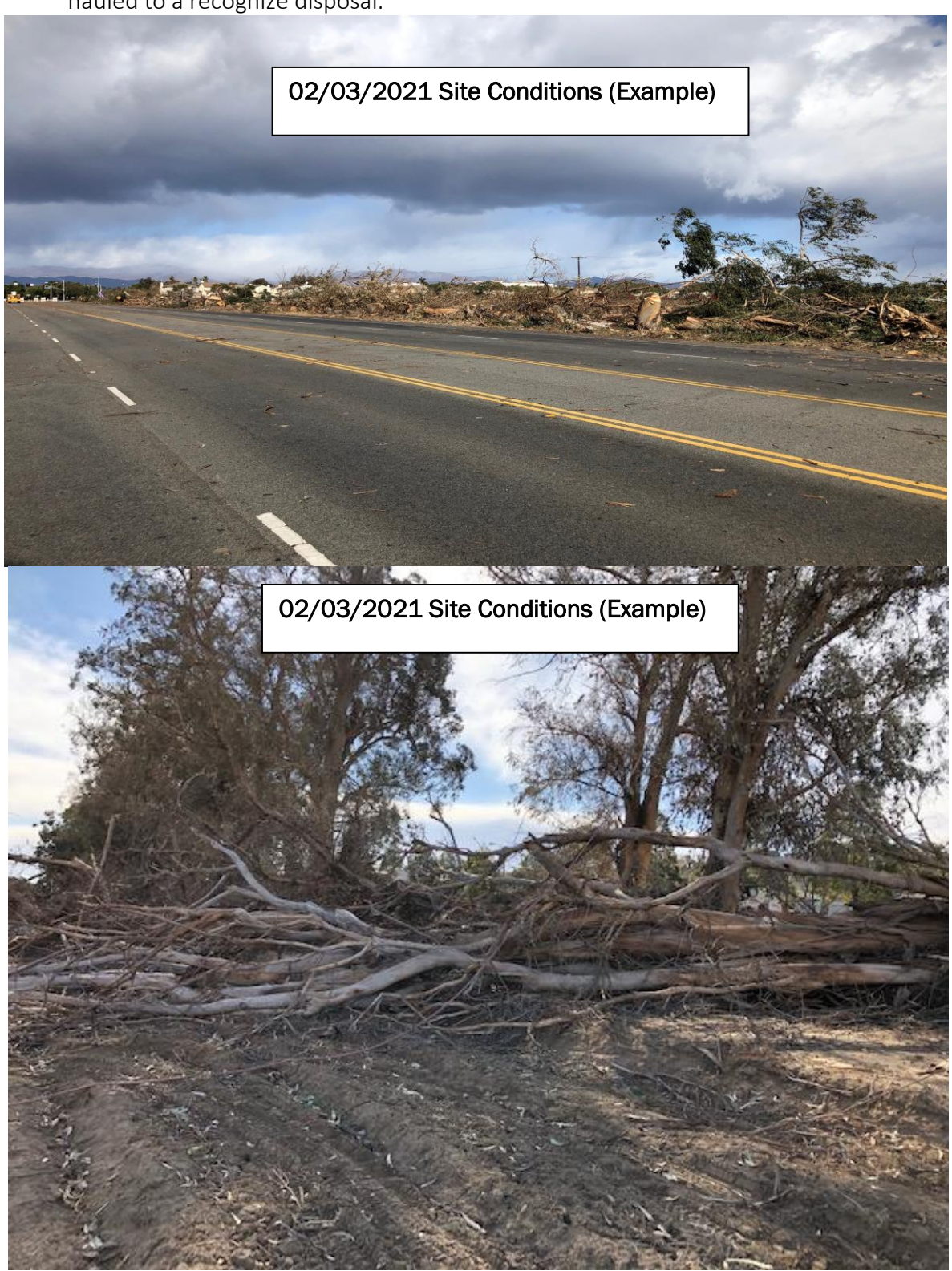
OUHSD Addendum #2 Bid 645 Rose Avenue Tree Removal for Del Sol High School