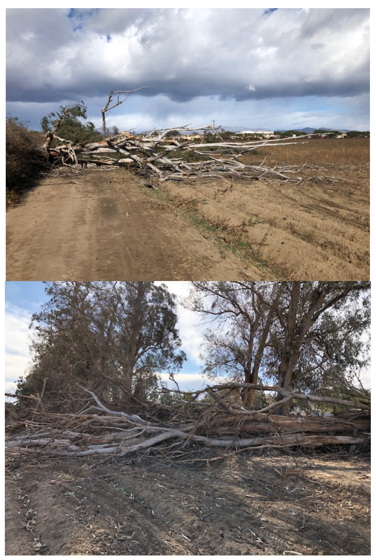
OUHSD\ Addendum\ \#I\ Bid\ 645\ Rose\ Avenue\ Tree\ Removal\ for\ Del\ Sol\ High\ School